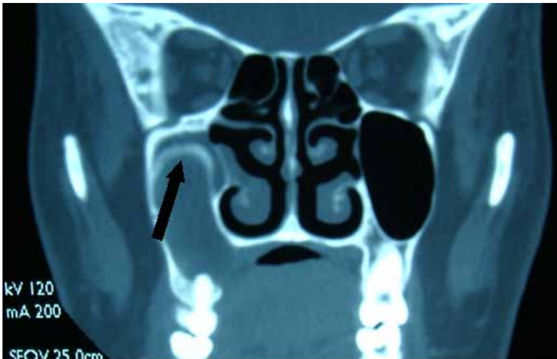
Figure 1: CT scan picture illustrating a cystic mass displacing the floor of maxillary sinus (arrow) giving a double wall appearance

walls and exhibiting a double wall appearance superiorly (Figure 1). The mass was arising from the alveolar process of the left maxilla without the presence of the impacted tooth within. Based on the patient's history, physical examination and CT scan findings, we concluded that she had a benign jaw cyst. Excision of the cyst was planned and intraoperatively under general anaesthesia, a sublabial incision was employed after local anaesthesia was administered at the upper left gingivobuccal sulcus. Initially, enucleation was performed under direct visualisation, but as the cyst extended superiorly, pushing the floor of the maxillary sinus until it approached the roof of the maxillary sinus, further enucleation was hampered by poor visibility and illumination. From this point onward, enucleation was carried out with the assistance of a rigid (0-degree) endoscope, which was held with the most dominant hand while the other hand performed the enucleation. The cyst was noted to have been attached firmly to the root of the erupted left upper canine, which was subsequently extracted. The patient's postoperative period was uneventful, and she was discharged on the second postoperative day. Postoperative histopathological examination reported the mass as a radicular cyst.