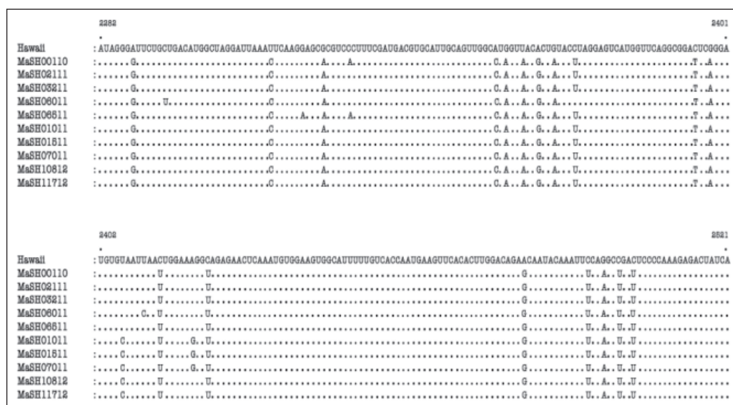
Figure 1. Nucleotide sequence (240 bp) of all isolates in the study. The top sequence is DENV-1 prototype Hawaii strain.

The E/NS1 gene sequence data of all ten DEN-1 isolates are showed in Figure 1. Nucleotide positions were numbered according to Mason et al. (1987). In this particular study, DEN-1 prototype Hawaii strain was used as the reference sequence. Sequence analyses of the ten isolates showed that there were 7 differences in the nucleotides within the sequenced region. However, there was 97% to 100% identity among them. In contrast, comparison with prototype Hawaii strain showed that the nucleotide percentage identity was only around 91% to 92% with 25 differences in the nucleotide.