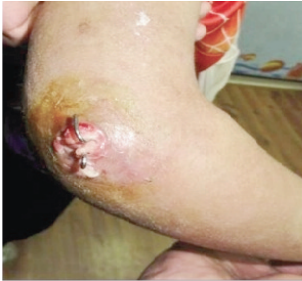
Fig. 1: Pin tract infection in percutaneous K-wiring.