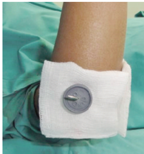
Fig. 3b: The piece of gauze prevents the rubber stopper from direct skin contact.