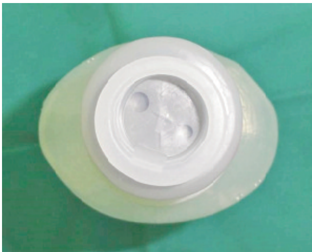
Fig. 3a: Rubber stopper from an intravenous solution bottle.