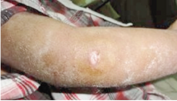
Fig. 4: No pin tract infection after removal of rubber stopper and gauze at 3 week.

After percutaneous K-wire insertion, the pin site was dabbed with povidone iodine solution (Figure 2b). A key hole was made in a piece of sterile gauze which was then inserted through the K-wire (Figure 2c). The rubber stoppers were obtained from empty intravenous solution bottles (Figure 3a) and sterilized. A small hole was made using another K-wire in the center of the sterilized rubber stopper. The rubber stopper was then inserted through the percutaneous K-wire and pressed snugly against the skin to ensure uniform pressure (Figure 3b).