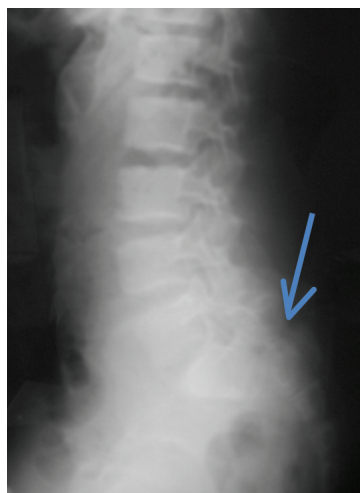
Fig. 1: Plain radiography showing dislocation of S1 and S2 (blue arrow), which could easily be missed.