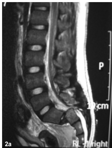
Fig. 2: (a) T2-weighted MRI sagittal view showed dislocation of S1/S2 compressing the nerve roots; Figure 2(b) T2-weighted MRI axial view showing compression of traversing nerve roots.