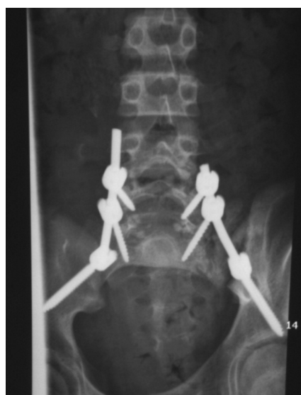
Fig. 3a: Plain radiograph showed lumbopelvic fixation (Pedicle screws inserted at both L5 and S1, and one lower pedicle screw inserted inferior to posterior iliac spine, aimed towards the acetabular dome).