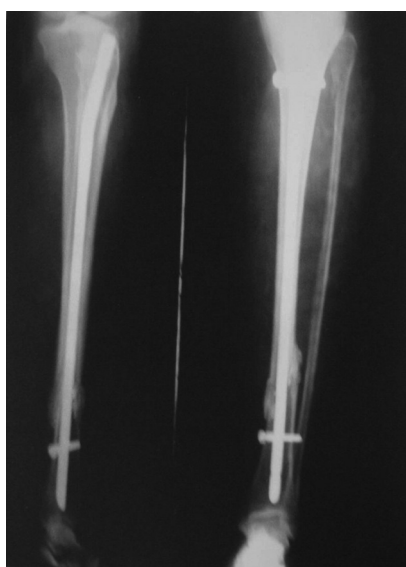
Fig. 4: Postoperative radiograph, unreamed procedure.