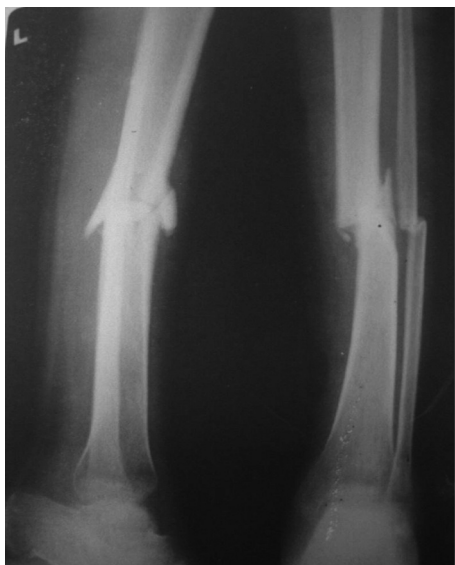
Fig. 1: Preoperative radiograph of patient before reamed nailing.