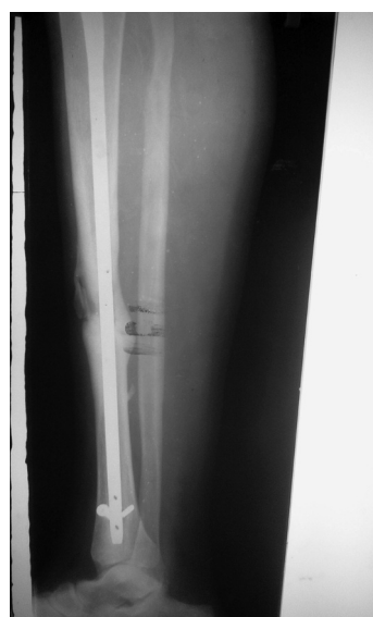
Fig. 5: Radiograph showing screw breakage, a complication of reamed nailing.

group, out of 18 cases, 5 cases developed complications. There was one case of external rotation deformity, one case of knee stiffness, 2 cases of ankle joint stiffness and one case of knee pain 13 .