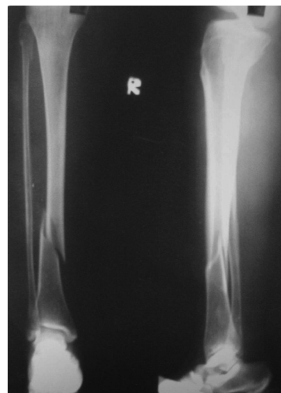
Fig. 3: Preoperative radiograph, unreamed procedure.