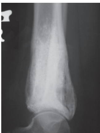
Fig. 3: Plain x-ray F/U at 13 months showing reconstituted posterior cortex.

When extensive or multiple defects in the cortical walls cannot provide this containment, a resection is performed. The resulting defect is reconstructed with a tumour megaprosthesis or a fusion is often performed across the joint using autografts or allografts 3-5 .