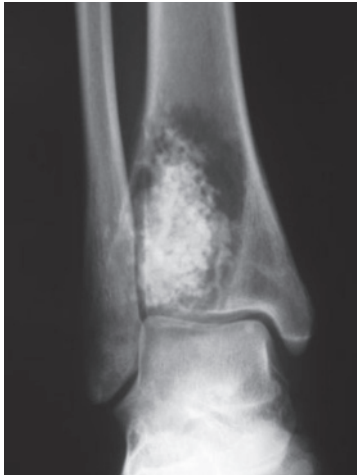
Fig. 1A: Plain x-ray AP view showing obvious recurrence after first surgery.