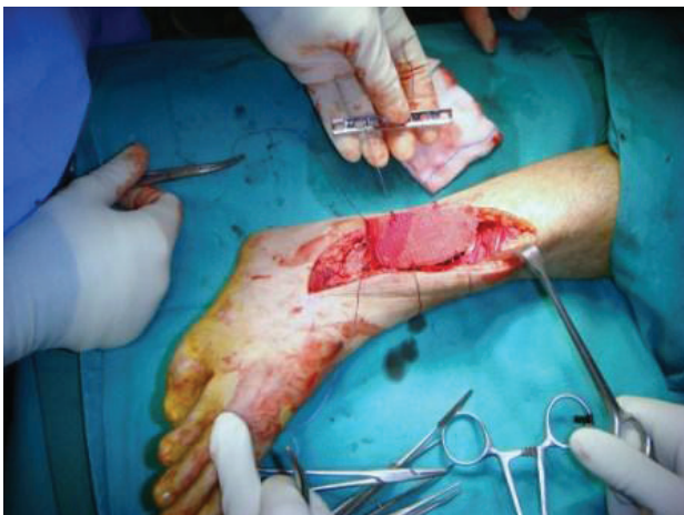
Fig. 2A: Polypropylene mesh before insertion into defect.