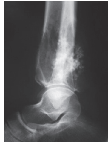
Fig. 1B: Plain x-ray lat. view showing loss of anterior and posterior cortices.