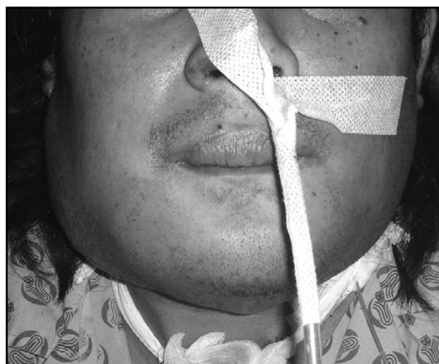
Fig. 3: Post operative picture after tumour resection and reconstruction with fibula osteocutaneous flap.