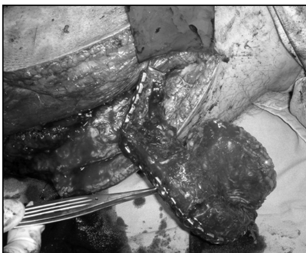
Fig. 2: Fibula was osteotomised and reconstructed to resemble mandible shape and fixed to reconstruction plate with intact pedicle.