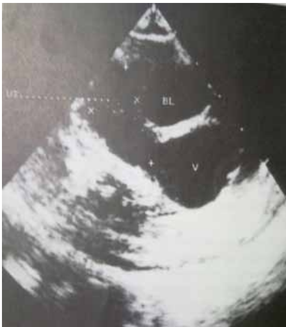
Figure 6: Ultrasound of the sagittal pelvis showing the bladder (BL) from an anterior view, uterus (UT) from a postero-superior view, and vagina (V) from a postero-inferior view.