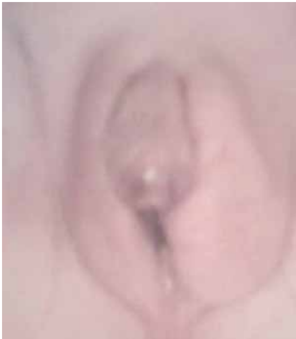
Figure 4: Ambiguous genitalia in a 46,XY patient known to have partial androgen insensitivity. Note the micropenis, urogenital sinus, and labioscrotal folds (the left fold contains a palpable gonad).