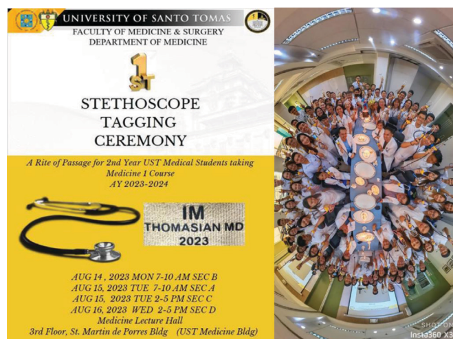
Figure 1. Poster of the first Stethoscope Tagging Ceremony