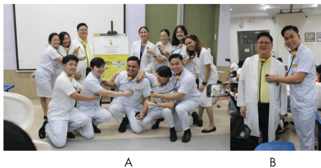
Figure 9. A., B. Placing the bell to the heart of the facilitator (representing the parents/guardians or loved ones or classmates)

she hears... the readiness that he/she will gain as he/she listens to the mentors, the wisdom that they impart shutting the other nuances and giving full attention to the best teacher of all ... the patients (Figure 8).