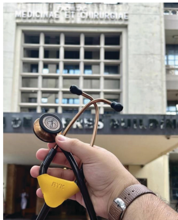
Figure 12. A stethoscope that is tagged with three virtues of St. Paul in front of the Medicine building.

respective facilitator. It was placed in the center of the stethoscope forming a triangle that stands for the three Cs of Thomasian Education, ie, COMPETENCE, COMPASSION, and COMMITMENT (Figure 10A, 10B, 10C).