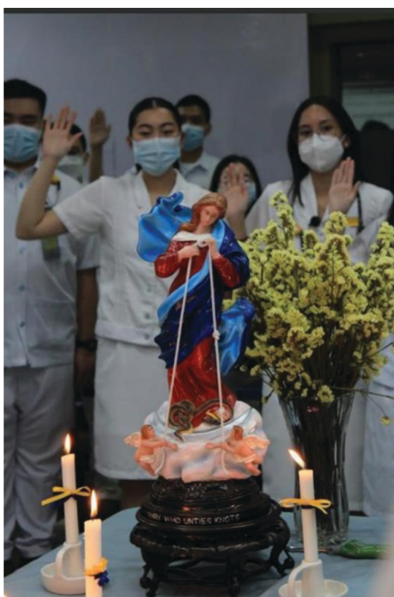
Figure 11. Pledge to Mary, Untier of Knots.

respective facilitator. It was placed in the center of the stethoscope forming a triangle that stands for the three Cs of Thomasian Education, ie, COMPETENCE, COMPASSION, and COMMITMENT (Figure 10A, 10B, 10C).