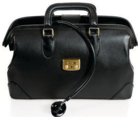
Figure 6. Opened medical bag bearing the stethoscope.