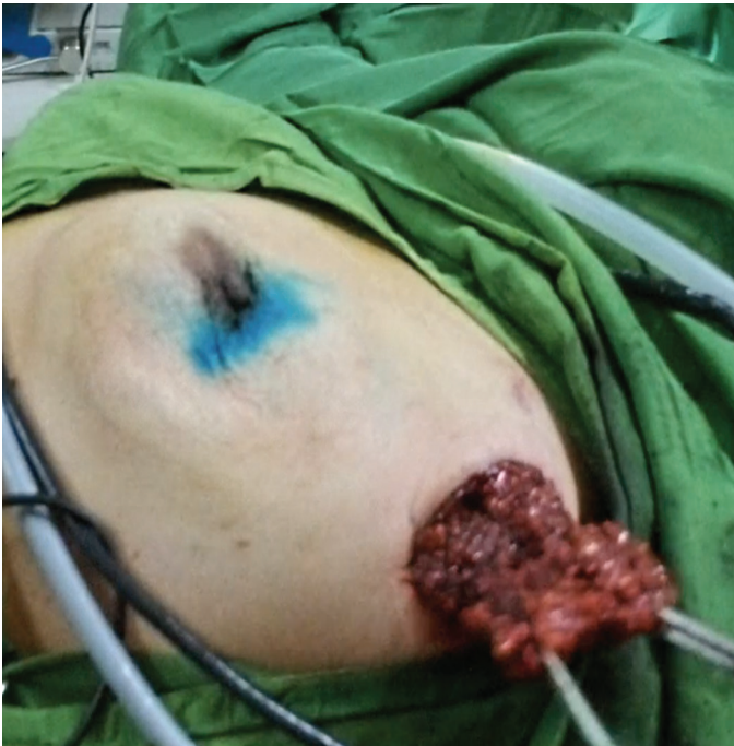
Figure 3. Image showing the dissected breast specimen being extracted through the axillary incision.