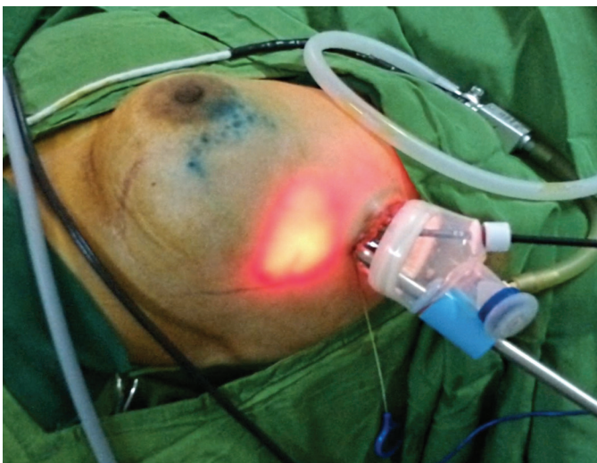
Figure 1. Image showing a single port device inserted in the axillary area at the incision site used for sentinel node biopsy.

After the retroareolar area has been dissected, tissue from the posterior retroareolar margin was taken and submitted for frozen section examination. If it was positive for malignancy, the operation was converted to skin-sparing mastectomy and the nipple-areola complex was excised.