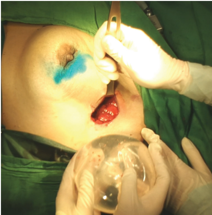
Figure 4. Image showing the implant before insertion through the axillary incision.