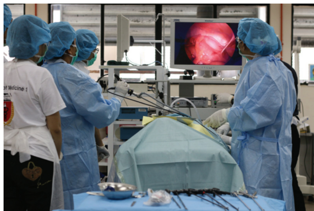
Fig. 2: Laparoscopic surgery is one of the most common procedure where surgeons can benefit from surgical simulation using cadavers.