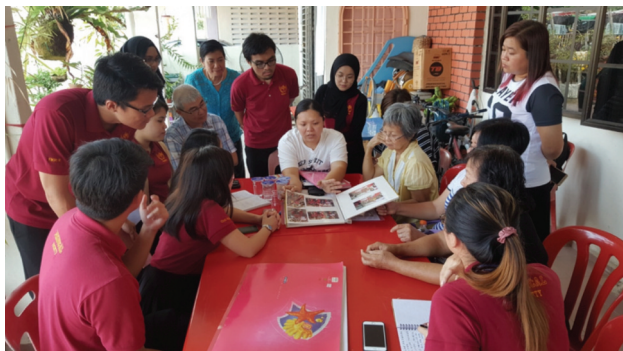
Fig. 1: A group of medical students from a few local universities visited the family of their mentor to get to know his / her family background.