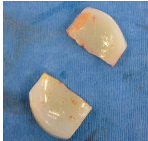
Fig. 2: Retrieved bearing insert showing the clean fracture through the thinnest part and minimal wear of the polyethylene insert.