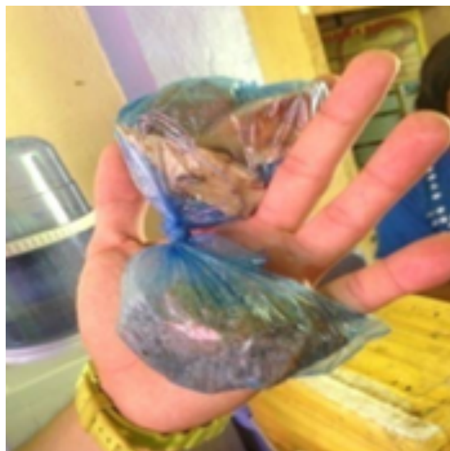
Fig. 2. Packed meal

minutes) and the symptoms manifested by cases suggest a Staphylococcus aureus enterotoxin poisoning. Staphylococcus aureus was seen in the human specimens and food samples (beef steak); both consumption of Filipino-style beef stew and stir-fried noodles were statistically most likely to be associated with the illness.