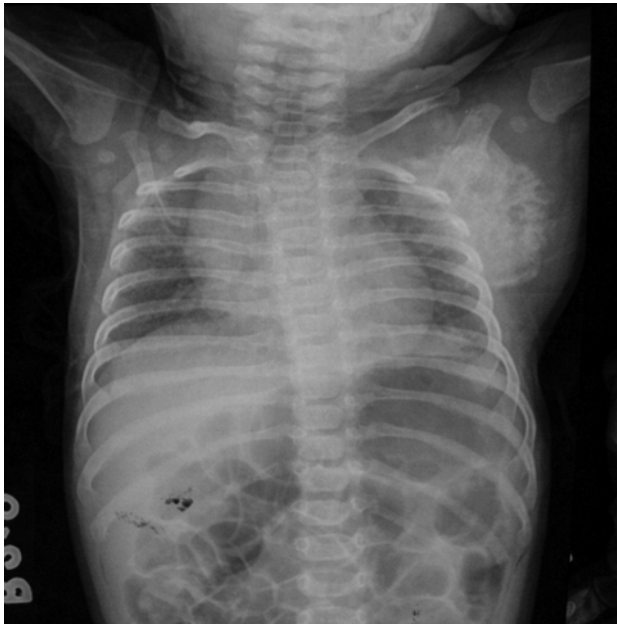
Fig. 1: Anteroposterior radiograph of the right shoulder showing obvious destruction of the glenoid and the lateral border of the scapula with normal humeral head.