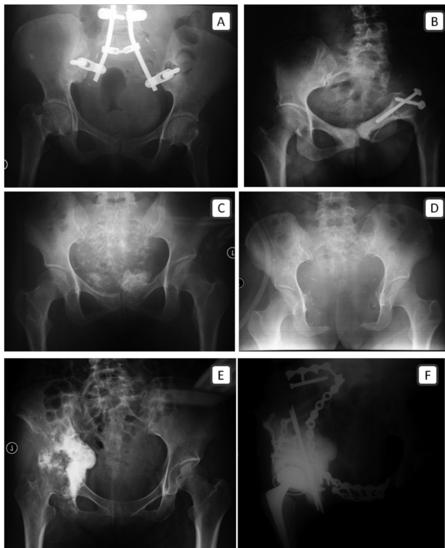
Fig. 1: Anteroposterior plain radiographs of the pelvis. Galveston iliolumbar fusion following iliosacral resection (A). Ischiofemoral arthrodesis following ilioacetabular resection (B). Osteosarcoma of the pubic bone resection without reconstruction (C, D). Osteosarcoma involving the ipsilateral ischiopubis, acetabulum and ilium, resected and reconstructed with a modified Harrington procedure (E, F).

LSS – limb salvage surgery, EH – external hemipelvectomy, NED – no evidence of disease, AWD – alive with disease, DOD – died of disease, DWD – died with disease.