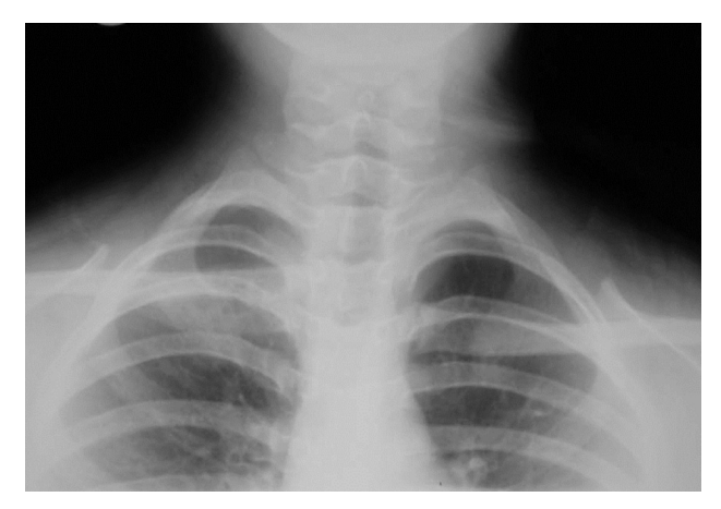
Fig. 1a: Plain radiographs at presentation showing a poorly defined, destructive lesion over the medial third of the right clavicle.