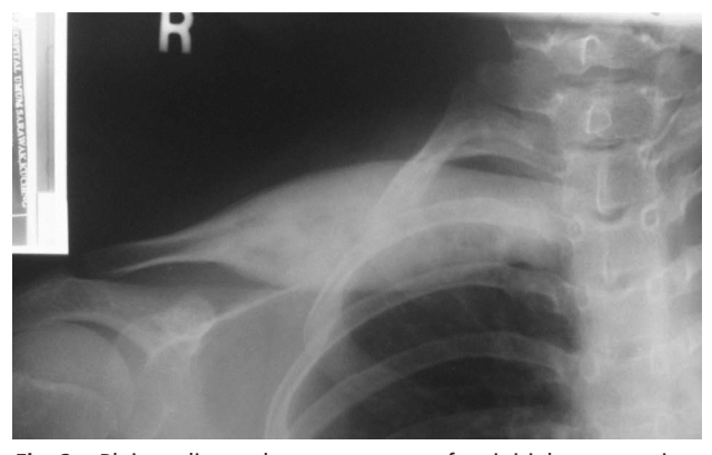
Fig. 2a: Plain radiographs at two years after initial presentation showing an enlarged sclerosed clavicle.

one area (Fig 2b) leading to another six-week course of antibiotics. At the last follow-up, 5 years after initial presentation (in October 2011) she was well except for a prominent, mildly tender swelling over the right clavicle.