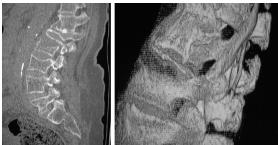
Fig. 2: Computed Tomography of the spine with sagittal and 3-D reconstruction scans revealed a bony "Chance type" fracture of L2 just below an old compression fracture.

plain radiographic features: wedge, biconcave or codfish and crush types of fracture 4 .