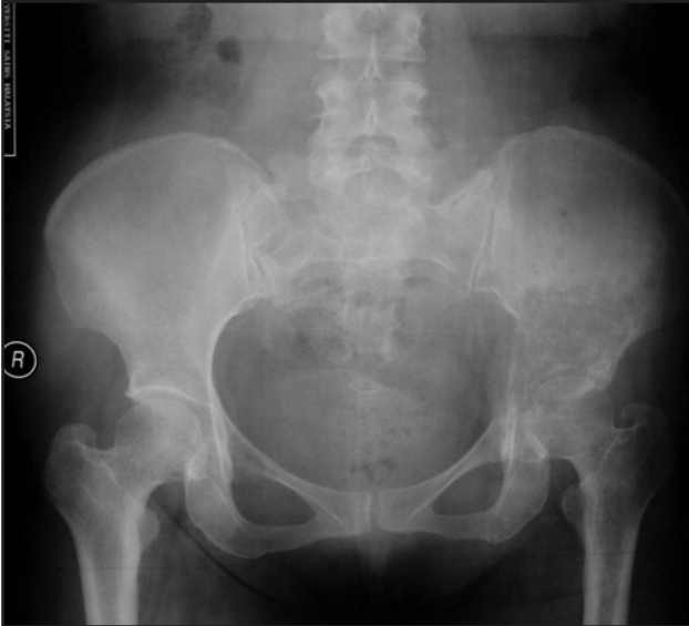
Fig. 1A: Left hip radiograph of a multiple myeloma patient showing class III acetabular destruction.