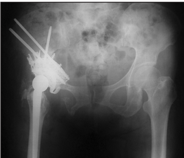
Fig. 3: Radiograph showing reconstruction of metastatic acetabular defect with threaded pins and anti-potrusio cage cemented. Multiple femur metastatic lesions reconstructed with long cemented stem.