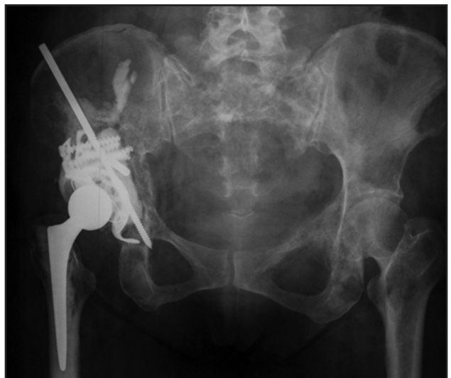
Fig. 4: Radiograph of metastatic breast cancer to acetabulum reconstructed with Harrington procedure