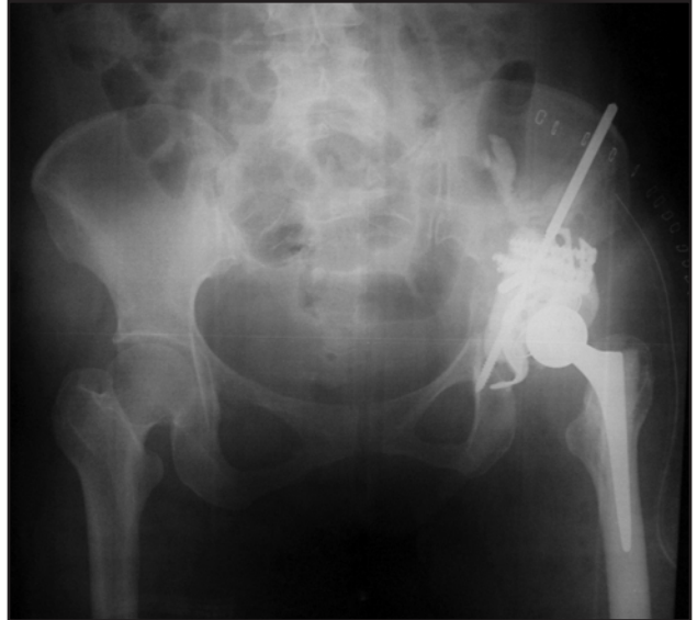
Fig. 1B: Radiograph showing a left hip replacement with multiple threaded pins and long screws with a flanged anti-potrusio acetabular cage.