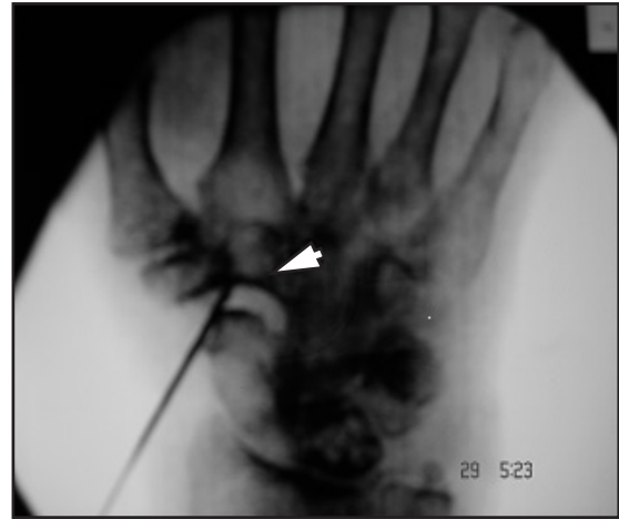
Fig. 2: Intraoperative fluoroscopic image of right wrist revealing isolated involvement of the scaphoid-trapezium joint with increased joint space (arrow head). The aspiration needle is visible in situ.