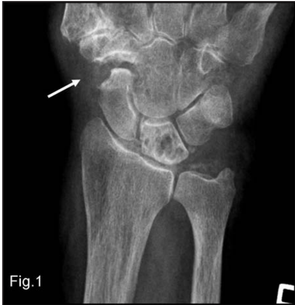
Fig. 1: Preoperative X-Ray of the wrist, revealing widening and erosion of the scaphoid-trapezium joint.