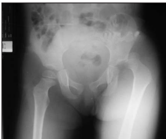
Fig. 1C: Posterior Dislocation of Left Hip.