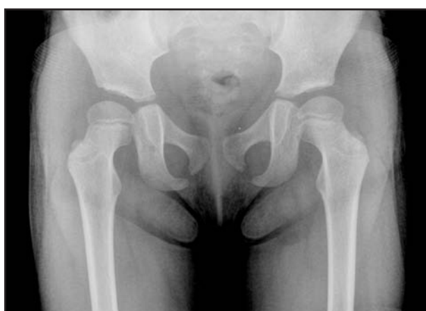
Fig. 2B: Plain radiograph of both hips showing no evidence of abnormal development eight months after reduction of the second dislocation.