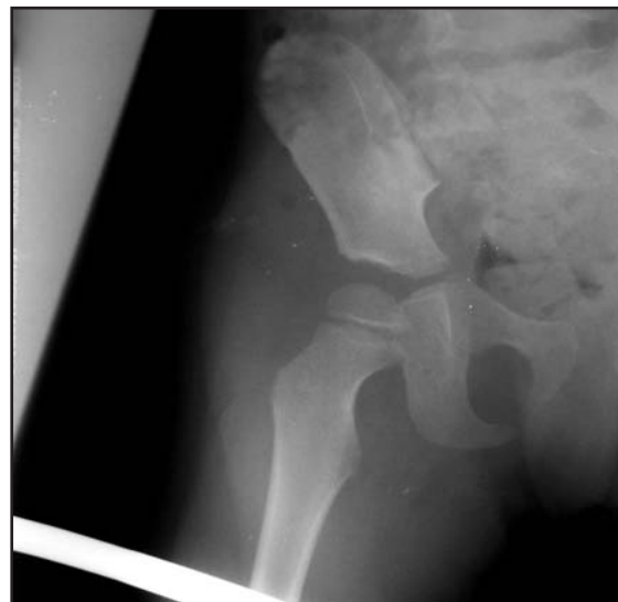
Fig.1B: Concentrically reduced right hip with applied traction.