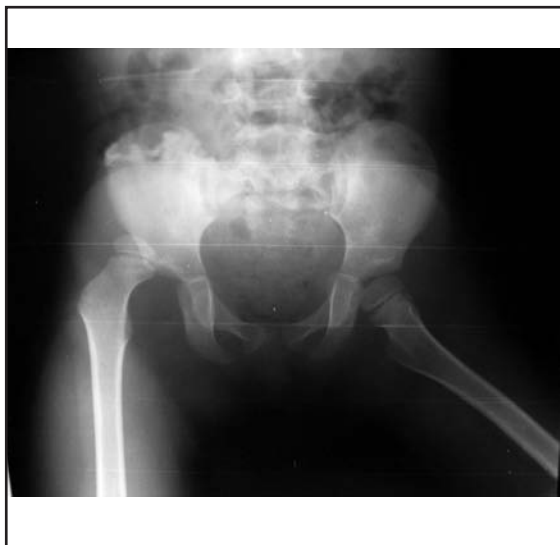
Fig 1A: Posterior Dislocation of Right Hip.