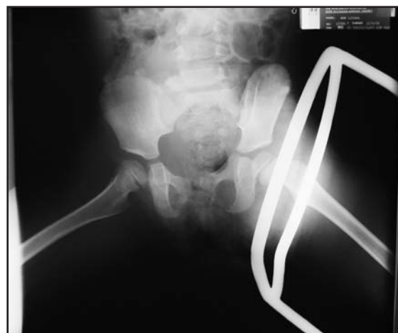
Fig. 1D: Concentrically Reduced Left Hip

structures are more flexible. This joint laxity also explains the absence of fractures of the acetabulum or femoral head in majority of the cases in these younger patients. The laxity reduces with age as does the cartilage to bone ratio 4 . As the child enters adolescence, the hip is more likely to dislocate only as a result of significant high-impact trauma more in line with the adult pattern of hip dislocation.