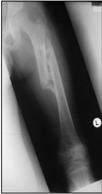
Fig. 1a: Radiograph shows mal-union shaft of femur.