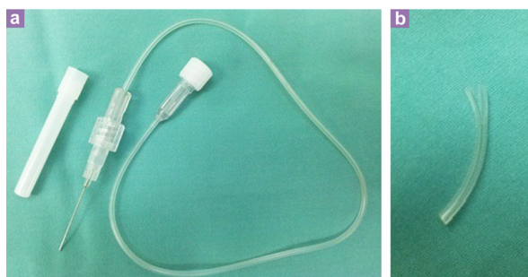
Figure 3: (a) Photograph showing the brachial plexus set. (b) The connector tube is used as a catheter, whereby the tip is cut into a flange and each end is sutured to the buccal mucosa.

same time prevent sensation or interference with chewing.