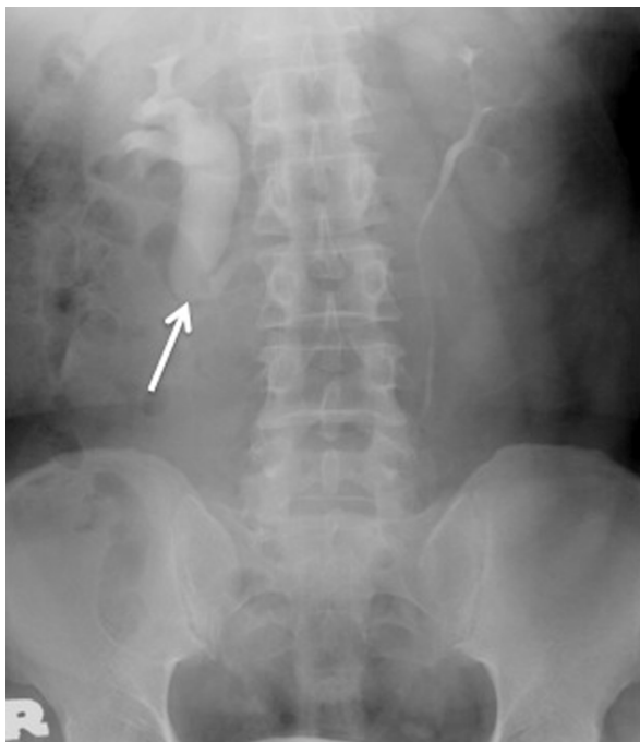
Figure 1: Intravenous urogram showing right-sided hydronephrosis and the dilation of the proximal ureter up to the level of the L3 transverse process. The medial deviation of the ureter at this level (arrow) gives rise to the typical fish hook or reversed S appearance.

IVU has some advantages; it can provide good image resolution and the examination can be modified according to the clinical needs, for example, obtaining delayed images or changing the patient's position to try to visualise the entire length of the ureter. Although not diagnostic, the appearance of retrocaval ureter on IVU is typical and is highly suggestive of the diagnosis (7). MSCT, however, is performed to confirm the diagnosis and to rule out other causes of ureteral deviation. On a CT scan, the lateral placement