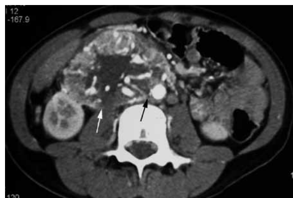
Figure 2: Abdominal computed tomography scan that was done at the time the child presented with gastrointestinal bleed shows a large heterogeneous inferior vena cava (IVC) mass, which is highly vascular with thrombus within the IVC lumen (white arrow). There is no clear fat plane between the mass and aorta (black arrow).

The child underwent laparotomy 1 day after the embolisation. Intra-operative findings showed an intraluminal IVC tumour that was densely adhered to the right kidney as well as the second and third part of duodenum. The right ureter was wrapped by the tumour and displaced laterally. Therefore, the whole tumour was dissected away from the aorta and resected. Right nephrectomy and resection of the second and third part of duodenum were done. Sutures closed both ends of the IVC stump. There was minimal intra-operative blood loss (less than 1 litre).