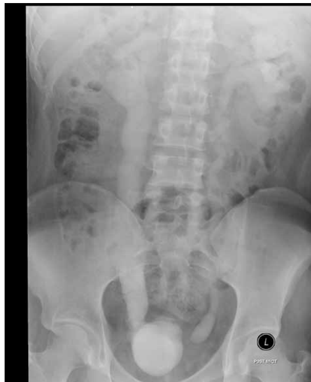
Figure 1b: Post-voiding pyelogram showing right vesico-ureteric reflux (VUR) with gross dilatation of right ureter