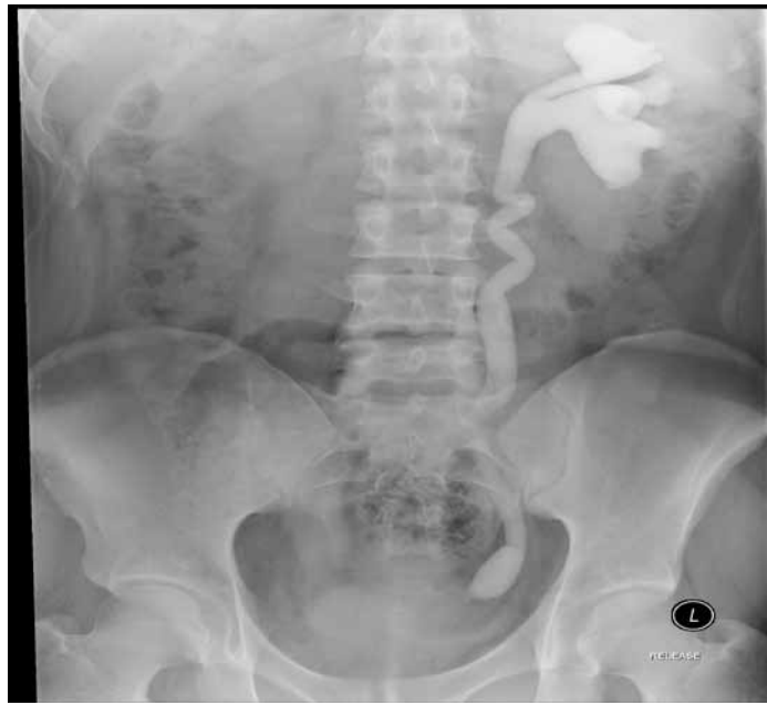
Figure 1a: Intravenous pyelogram showing moderate left hydronephrosis and hydroureter with a non-excreting right kidney