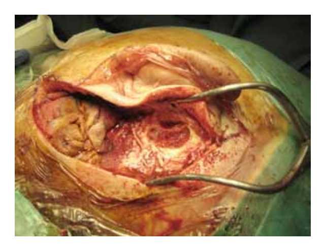
Figure 3: Cortical mastoidectomy performed concomitantly with fasciotomy.

the infection progressed to involve the larynx and mediastinum. Subsequently, she developed septicaemic multi-organ dysfunction. Family members were consulted regarding her poor prognosis, and they requested to bring her home. She then expired at home a few days later.