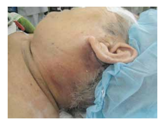
Figure 1: Necrotizing fasciitis involving the neck with post-auricular inflammation secondary to acute mastoiditis.

A 70-year-old Chinese female presented with a three-day history of painful left facial and neck swelling associated with odynophagia. She had a recent hospital admission for uncontrolled diabetes mellitus. Examination revealed a dehydrated patient with an inflamed left hemifacial region extending to the submandibular region and crossing the midline. She also had trismus. Intraoral examination revealed a left buccal ulcer and dental carries affecting the left lower canine and premolars. Ultrasonography of the neck showed an ill-defined hypoechoic collection with