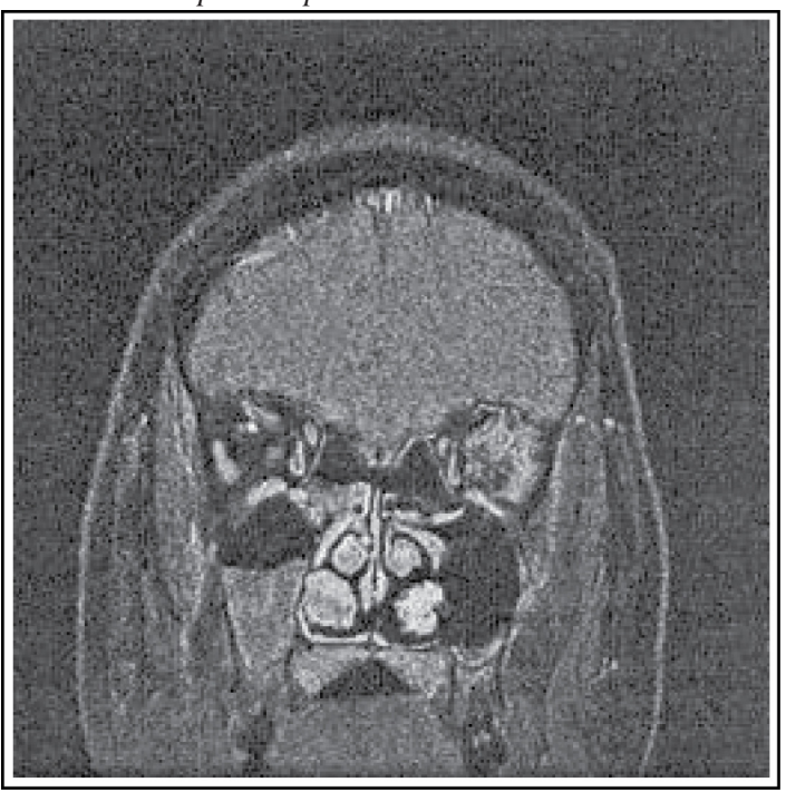
Figure 4: Magnetic resonance imaging showing left superior ophthalmic vein thrombosis

Reddy reported that orbital cellulitis secondary to ethmoiditis in 25%, maxillary sinusitis in 10% and ethmoid and maxillary sinusitis in 30% of patient (10). The thin lamina papyracea divides the orbit from the ethmoidal sinus and permits infection to spread with relative ease. Infection may erode through the bone or pass through the numerous small valveless veins that perforate the bone (10, 12).