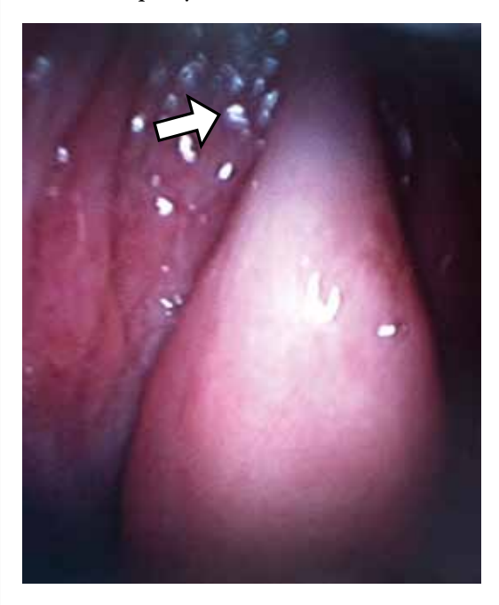
Figure 1. Endoscopic view of the nasopharyngeal cyst with its stalk (arrow) arising from the roof of the nasopharynx.

As the mass appeared to originate from the roof of the nasopharynx, a CT scan was done to rule out an intracranial problem such as a meningocoele. The CT scan showed no intracranial extension of the soft tissue mass which measured 2.6cm x 1.3cm x 1.0cm extending from the left side of nasopharynx into the oropharynx.