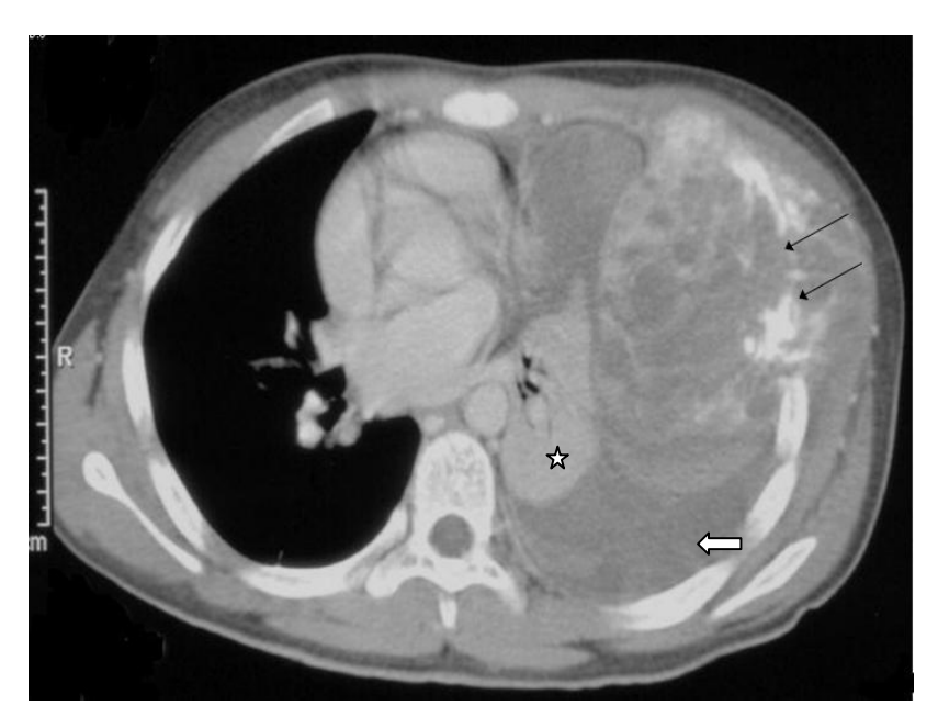
Figure 2 A contrast enhanced CT examination of the chest showing a large heterogenously enhancing solid mass arising from the skeletal chest wall with lytic destruction of the rib and calcifications (arrows). There is a moderate-sized pleural effusion (block arrow) and underlying lung collapse and consolidation (star).

Figure 1 Chest radiograph showing a large pleural-based mass in the left hemithorax (arrows), with underlying rib destruction and a pleural effusion.