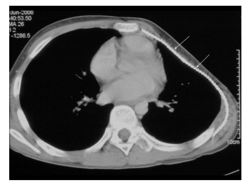
Figure 4 CT examination of the chest post-chemotherapy and chest wall surgery showing deformity of the left chest wall at site of extensive rib resection. The titanium mesh is seen in situ (arrows). There is no evidence of tumour recurrence.