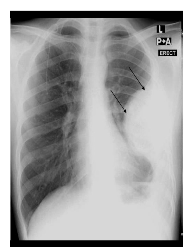
Figure 1 Chest radiograph showing a large pleural-based mass in the left hemithorax (arrows), with underlying rib destruction and a pleural effusion.