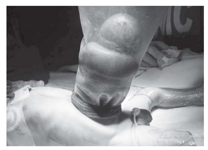
Figure 2 . Photograph of the abdomen of a neonate with gastroschisis after application of a PSLS bag.

emergency room or at the NICU. After application of the silo bag, patients were observed for bowel and abdominal wall discoloration and O_2 saturation at the NICU for close monitoring. Manual reduction of the eviscerated bowel inside the silo was done on a daily basis. Delayed primary closure was considered after it was observed that the abdominal cavity could contain the residual volume of eviscerated bowel. This volume was usually reached within 5-7 days after silo bag application. The delayed primary fascial closure was performed at the operating room. The patient was returned to the NICU for post-operative critical care.