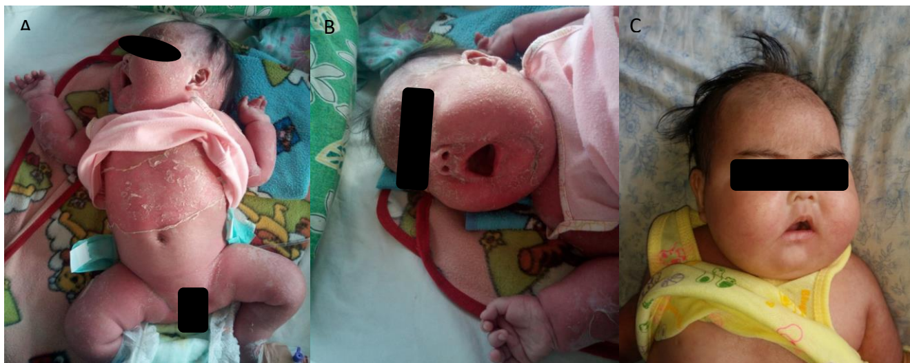
Figure 1. On dermatologic examination, there was noted generalized erythema with scaling (A,B) together with moon facies with visible telangiectasia over the cheeks, patchy hair loss and hirsutism (C)

Laboratory results included a complete blood count which showed anemia, leukocytosis and thrombocytosis. A chest radiograph showed progressive bilateral pneumonia, and arterial blood gas indicated a fully compensated metabolic acidosis. C-reactive protein was elevated while alkaline phosphatase was normal. Urine, stool and wound