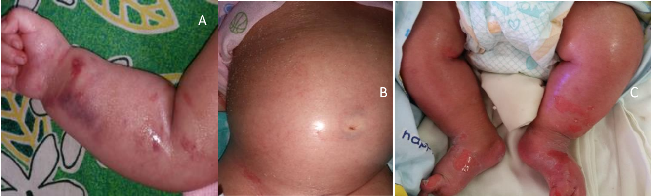
Figure 3. On the 16 th hospital day, noted bruising (A), enlarging abdomen (B) and areas of erosion after removal of plaster demonstrating skin fragility (C).

In this particular case, the topical steroid - induced Cushing syndrome due to improper use of Ketoconazole + Clobetasol cream could have been the predisposing factor to the development of pneumonia and SSSS. The catastrophic outcome was a result of the complex interplay of the compounded problems due to these three disease conditions.