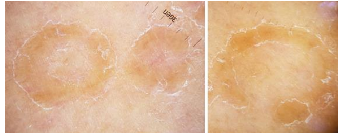
Figure 2. Dermoscopy revealed peripheral, structureless yellow-orange borders with whitish scaling and branching or linear vessels.

The patient was started on acitretin 20mg/day, with concurrent narrowband ultraviolet-B (NB-UVB) phototherapy 2 times per week for 3 months. Patient underwent 25 sessions with a cumulative dose of 2321.580 J/cm 2 . Liver enzymes and lipid profile were monitored every month for the first 2 months, then every 3 months,