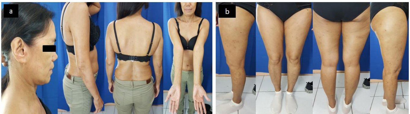
Figure 4a-b. There is decreased number and flattening of lesions after 5 months of acitretin 20mg/day, combined with NB-UVB phototherapy with a cumulative dose of 2321.580 J/cm 2 .

GA on histology is characterized by necrobiosis or mucinous degradation of collagen with either palisading or interstitial granulomatous infiltration. 3 The presence of mucin is the key histological feature to distinguish GA from other non-infectious granulomatous diseases such as sarcoidosis and necrobiosis lipoidica. 4 The histiocytes in GA have been described in four patterns: (1) interstitial pattern, (2) surrounding the palisading granulomas, (3) nodules that resemble sarcoidosis, and (4) a mixed pattern. 4,6