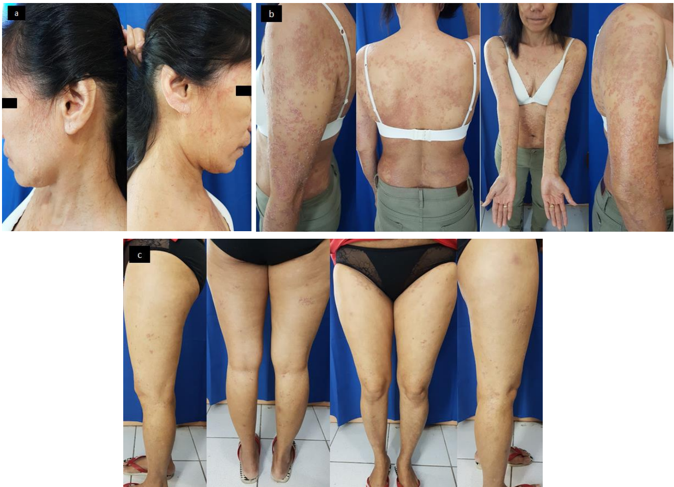
Figure 1a-c. Multiple skin colored to erythematous papules and scaly annular plaques on the face, trunk and extremities.

which all revealed normal results. During this period, there was noted decrease in the number of lesions and flattening of plaques (Figure 4). Dermoscopy of resolved lesions show lightening of yellowish-orange areas, clearing of irregular borders and scales and disappearance of the linear blood vessels (Figure 5). Patient was followed up