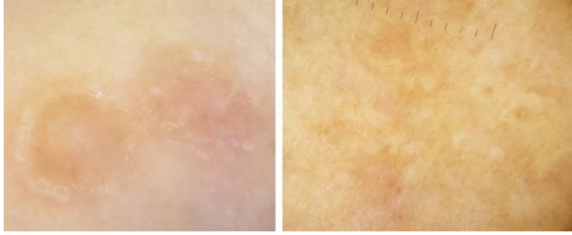
Figure 5. Dermoscopy at baseline (a) and (b) resolved lesions which show lightening of yellowish-orange areas, clearing of irregular borders and scales and disappearance of the linear blood vessels after 5 months of treatment.

Aside from biopsy, dermoscopy is a non-invasive diagnostic tool that aids in the diagnosis of GA. According to the study of Errichetti et al, the presence of blurry vessels having variable morphology (dotted, linear-irregular, and branching) over a more or less evident pinkish reddish background is a nearly constant dermoscopic feature of GA. Whitish (irregular or globular) and yellowish-orange (focally or diffusely distributed) areas represent the most common non-vascular findings. Additional dermoscopic findings include pigmented structures and crystalline leaf venations (whitish, parallel, secondary striae branching from a central vein). By analyzing dermoscopy of GA according to histological subtypes, Errichetti and colleagues observed a strict association between yellowish-orange structureless areas, especially those having diffuse distribution, and a palisading granuloma histological pattern, thereby confirming the well-known dermoscopic-pathological correlation between such a color and dermal granulomatous inflammatory infiltrate. On the other hand, although quite uncommonly (less than one fifth of cases), focally distributed yellowish-orange structureless areas were also detected in lesions displaying an interstitial histological pattern. 7