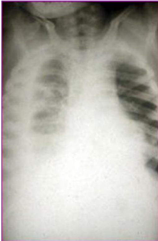
Figure 1. Chest roentgenogram indicating right pleural effusion in a patient with dengue hemorrhagic fever.

Activation of the complement system with profound depression of C3 and C5 levels in serum and the formation of immune complexes are found in all cases. The peak in complement activation and the presence of C3a and C5a anaphylatoxins coincide with the onset of shock and plasma leakage. Levels of C3a correlate closely with disease severity.