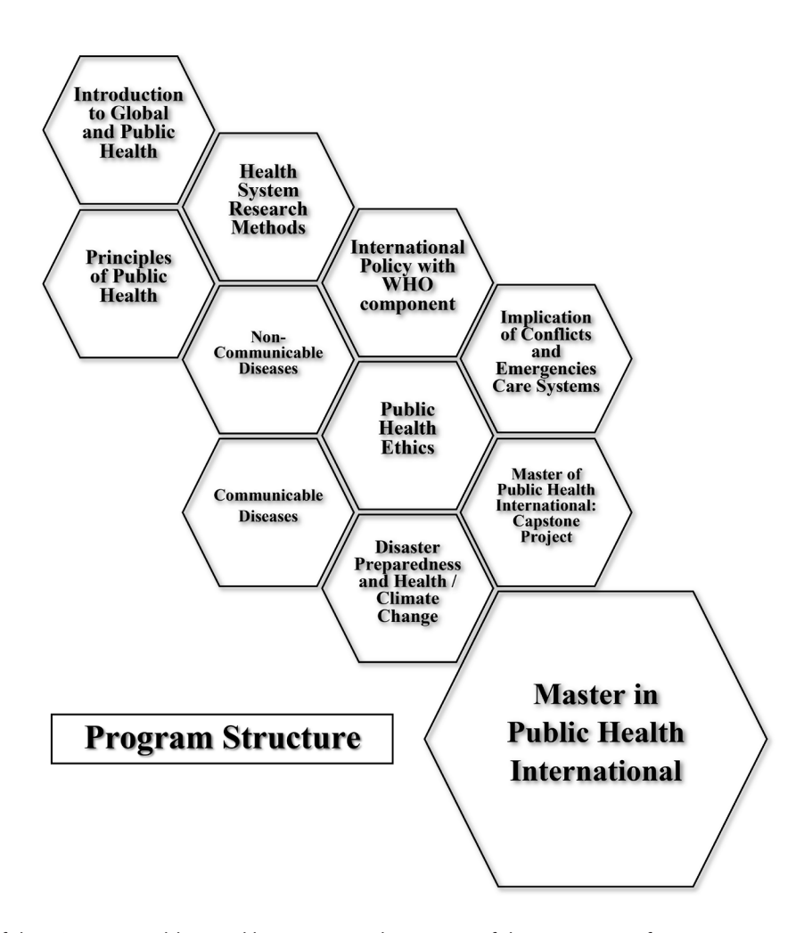
Figure 2. Scheme of the Master in Public Health International program of the University of Santo Tomas, Faculty of Medicine and Surgery and Nuffield Centre for International Health and Development of the University of Leeds.

international issues, settings, and practice, and with focus on the middle- and low-income Asian regions. This is a laddered program with a single award to be given by the UST with a Postgraduate Certificate from the UoL.