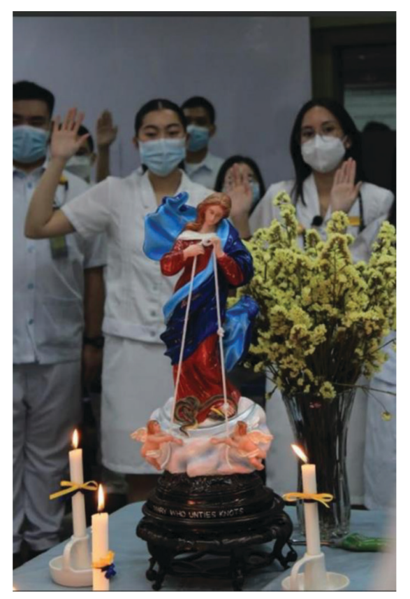
Figure 11. Pledge to Mary, Untier of Knots.

respective facilitator. It was placed in the center of the stethoscope forming a triangle that stands for the three Cs of Thomasian Education, ie, COMPETENCE, COMPASSION, and COMMITMENT (Figure 10A, 10B, 10C).