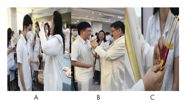
Figure 10. A., B., C. Each student was individually "tagged" at the center of the stethoscope by his/her respective facilitator.