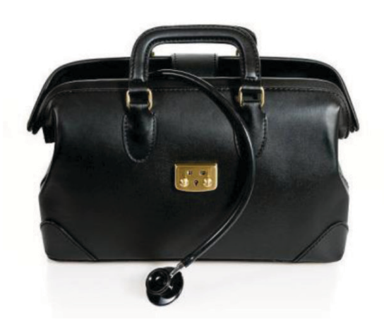
Figure 6. Opened medical bag bearing the stethoscope.