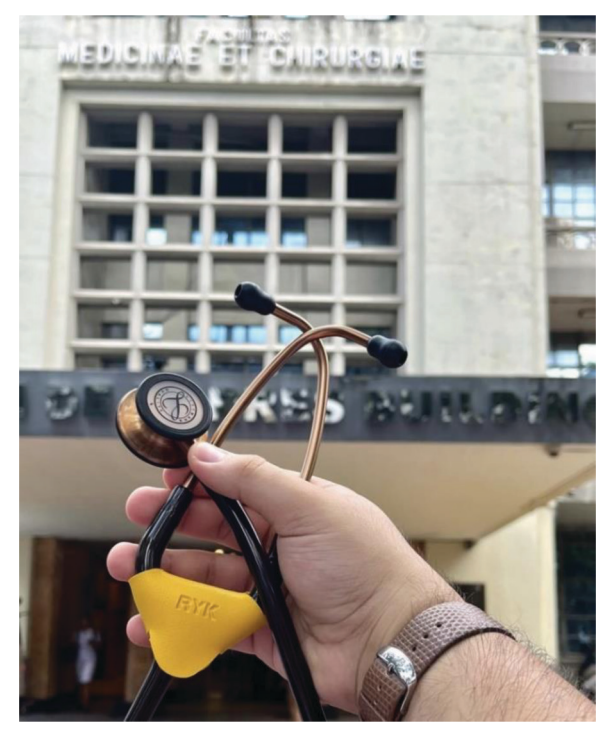
Figure 12. A stethoscope that is tagged with three virtues of St. Paul in front of the Medicine building.

respective facilitator. It was placed in the center of the stethoscope forming a triangle that stands for the three Cs of Thomasian Education, ie, COMPETENCE, COMPASSION, and COMMITMENT (Figure 10A, 10B, 10C).