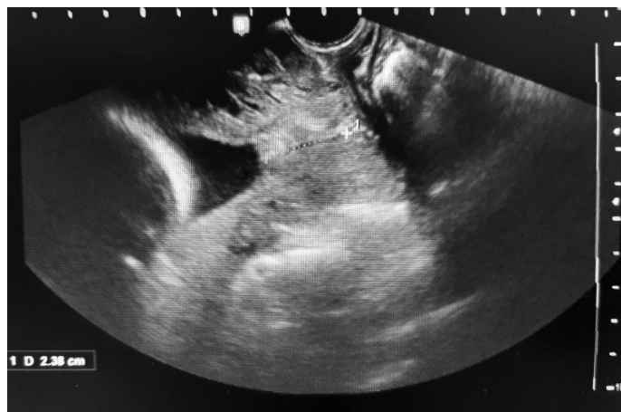
Figure 2. Cervical length post insertion of pessary

She was monitored post insertion for contractions as well as for watery and bloody vaginal discharge. Repeat cervical length determination was done on the same day after insertion of the pessary. The scan showed cervical length of 2.38 cm with no funneling. (Figure 2)