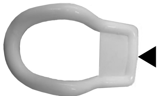
Figure 1. Actual Hodge pessary inserted in the patient. The arrow head is the part anchored to the posterior border of the symphysis pubis.