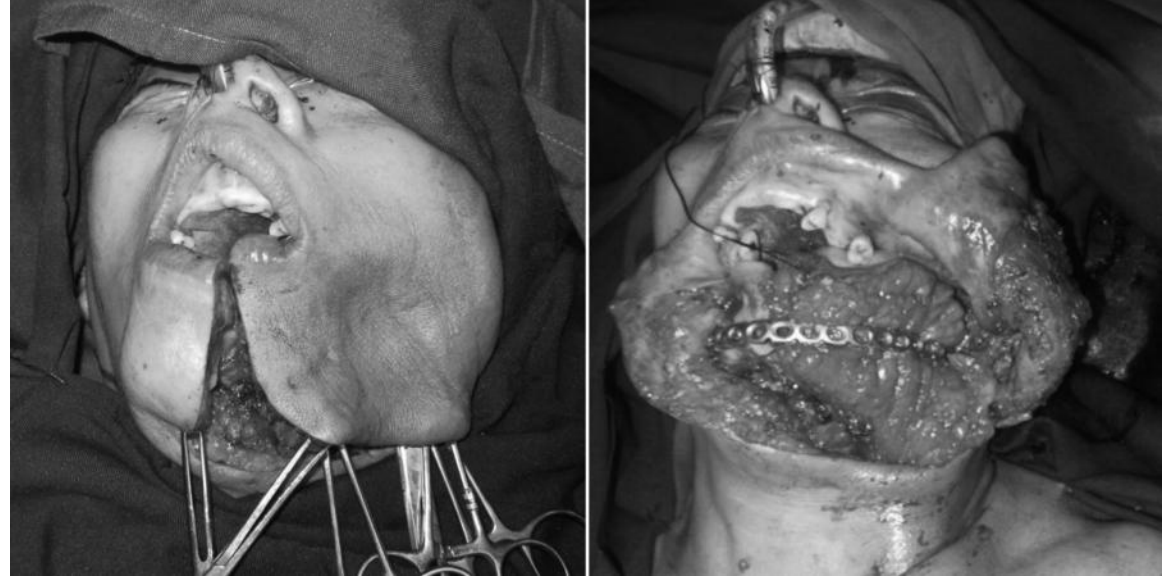
Figure 3. Intra-operative.

The patient was examined every 3 months and showed normal mouth opening and closure. There was improved articulation of speech, and swallowing was unhindered making patient maintain her normal body weight. So far, there were neither signs of plate failure nor tumor recurrence within the 3 years follow up. (Figure 4)