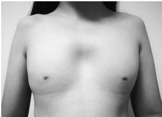
Figure 1. Physical examination showed webbed neck, shield chest with widely spaced nipples. There was no breast bud development.

Physical examination revealed a female phenotype with short stature. Height and weight were below the 5th percentile for age. She had a height of 142 cm, weight of 37 kg, and normal body mass index of 18.35 kg/m 2 . She was responsive to questions and had normal intelligence. Vital signs were stable. She had a webbed neck and broad chest with widely spaced nipples (Figure 1). Breast and pubic hair development were Tanner stage I. The rest of her cardiovascular, pulmonary, and abdominal examinations revealed no abnormalities. On pelvic examination, her labia majora and minora were developed. A vaginal dimple was seen. No palpable structures were identified during rectal examination.