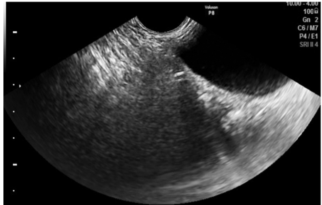
Figure 2. Transrectal examination showed absence of normal ovaries and uterus.

calyces were not dilated. No cardiac or vascular abnormalities were noted on 2D echocardiography. Chromosomal analysis revealed an abnormal female chromosome complement in 50 cells, with a single X chromosome (45, X). These findings were consistent with a clinical diagnosis of Turner syndrome with mullerian agenesis.