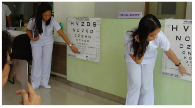
Figure 1. Visual Acuity Assessment using ETDRS Chart

After obtaining an informed consent, patients underwent a standardized interview to obtain their age, gender, hypertension history, managing/referring physician, diabetes medications, and duration of their DM; as well as a review of their latest glycosylated hemoglobin (HBA1C). Visual acuity assessment using the Early Treatment Diabetic Retinopathy Study (ETDRS) chart (Figure 1), and a one-field nonmydriatic 45 degree retinal photography using Topcon TRC-NW8F Non-Mydriatic Retinal Camera (Topcon Corporation, Tokyo, Japan) were performed (Figure 2). The screening of all patients was done on August 8, 2013.