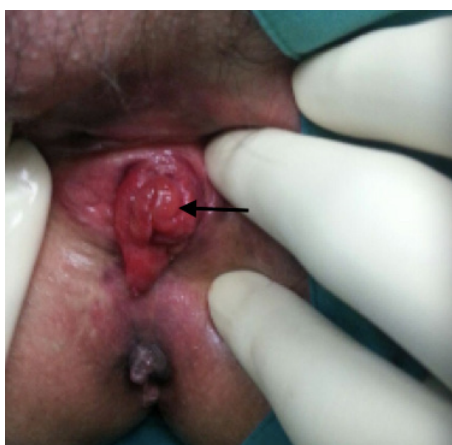
Figure 3: An oedematous polypoidal growth at the urethral meatus