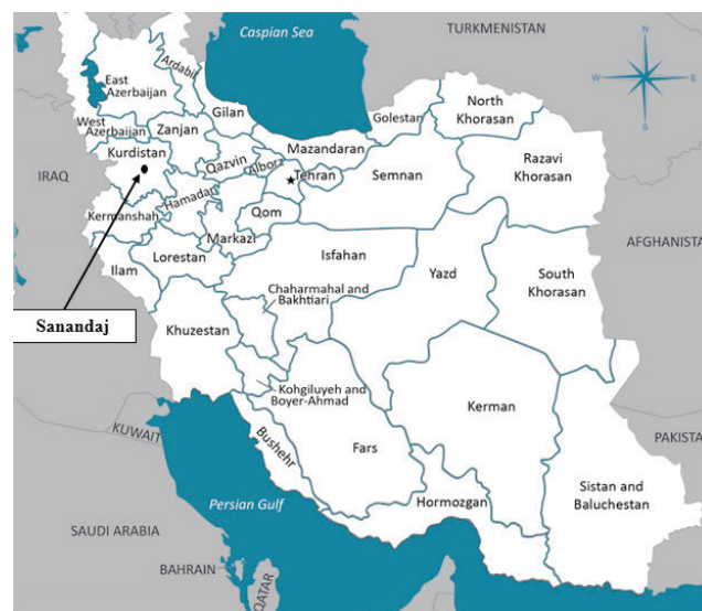
Figure 2. The Study Location

Data collection was conducted in the classroom during regular school hours and supervised by trained assistants without the presence of teachers. Persian version of anonymous and confidential self-administered questionnaire (answered by the respondents themselves) was used in this study. Participants were ensured of anonymity and confidentiality throughout the study. All question items were translated into Persian, which was verified by back-translation performed by a different professional person. The questionnaire was pretested