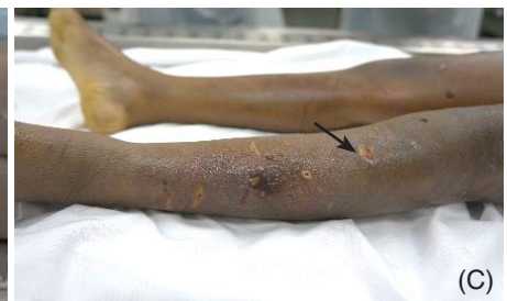
FIG. 1: (A) Large, healing, lacerations are seen on the forehead, with patchy bruises over the cheek. (B) The back of the child, with multiple 'tram-line' abrasions and scars, among other scars of various shapes. (C) Multiple scars are also seen on the legs and a few sinuses discharging pus (arrow)