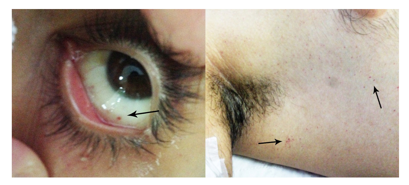
Figure 1: Images showing axillary, truncal and subconjunctival petechiae

A computed tomography pulmonary angiogram was performed to rule out pulmonary thromboembolism. The results revealed a filling defect within the secondary branches of the left descending, right upper lobe pulmonary artery and tertiary branches of descending right pulmonary artery, which indicated the presence of a thrombus (Figure 2). The patient was started on anticoagulation therapy, comprising of subcutaneous enoxaparin 60 mg twice daily.