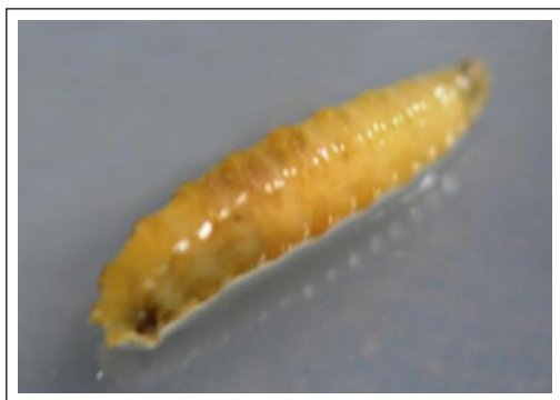
Figure 1. Third Instar larva of C. bezziana extracted from wound.

The larvae were creamish white, 12–18 mm long, worm like gradually tapering at the anterior end (Fig. 1). The anterior spiracles were plamate in shape each being composed of 4-6 lobes arranged in a single row located at dorso-posterior margin on each side of prothorax (Fig. 2a). The posterior spiracles consisted of three oblique slits encircled by dark thick peritreme that is incomplete ventro-medially around the compressed button (Fig. 2b). The cephalopharyngeal skeleton comprised of a pair of long, curved and stout mouth hooks with prominent dorsal arch and dorsal cornu. The ventral cornu is narrow, deprived of an aperture called