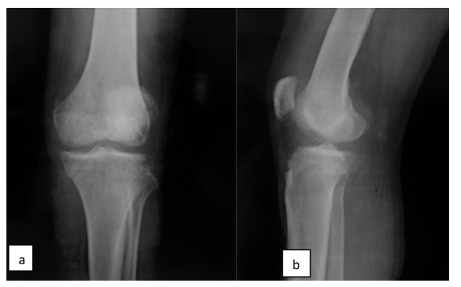
Fig. 3: (a) Antero-posterior and (b) lateral radiographs of knee joint showing reduction of joint after removal of Steinman pins.

site or reduced in the emergency department under sedation by closed manipulation <sup>4</sup>. There are case reports of old neglected knee dislocations ranging from four weeks to 15 years <sup>2</sup>. The treatment options include open reduction and fixation with Steinman pins, Ilizarov techniques, hinged external fixators, arthrodesis, and total knee arthroplasty <sup>5</sup>. Vincente-Guillen et al <sup>2</sup> reported a 15-year old posterior knee