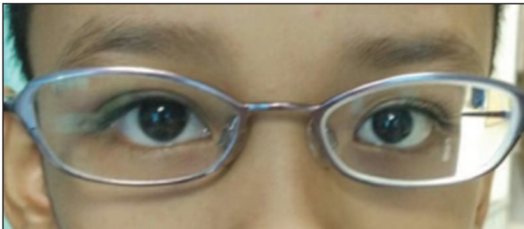
Figure 3: Photograph of the patient while using the full-correction spectacles which was well-tolerated despite the huge anisometropia.

method of treatment to the present time, and cryotherapy is generally reserved for patients with opaque media or other technical limitations to transpupillary photocoagulation.