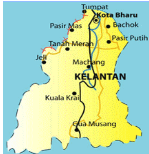
Figure 1: Ten districts in the state of Kelantan Malaysia.

Statistics (Population and Housing Census, Malaysia 2010).