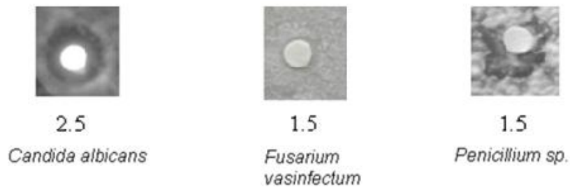
Figure 3: Antifungal activities of SPCs towards Candida albicans , Fusarium vasinfectum and Penicillium sp. at different protein concentrations (1.5 and 2.5 mg/mL).

most of them have shown the antifungal activity. It was reported that Stinging nettle rhizomes lectin, Klaxveromyces bulgaricus lectin, a lectin-like protein from Amaranthus caudatus and a chitinase-like lectin from Urtica dioica possessed the anti-fungal activities (Broekaert et al. , 1989; Verheyden et al. , 1995). SPCs showed noticeable activities against Candida albicans , Aspergillus fumigatus and Penicillium sp. The anti-fungal activities of SPCs showed good correlation with the activities of chitinases studied previously (Broekaert et al. , 1989; Verheyden et al. , 1995; Campos-Olivas et al. , 2001; Rebers and Willis, 2001; Suzuki et al. , 2002; Van Dellen et al. , 2002). From the above study it is obvious that Shilbilati potato chitinases (SPCs) possessed antimicrobial activities.