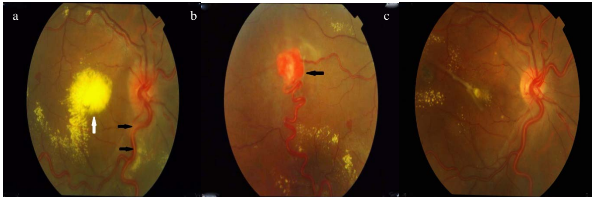
Figure 1: (a) Fundus photographs showing dilated, tortuous retinal veins (black arrow), large subretinal hard exudate at macula with edema (white arrow), (b) RHC on presentation (black arrow) and (c) post- laser and intravitreal Ranibizumab injections.