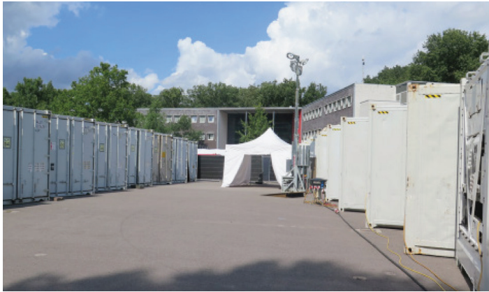
FIG.1: The parade square was used as a temporary body storage area