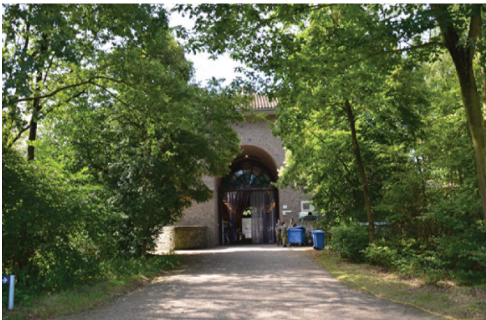
FIG. 2. The multi-purpose hall was used as a temporary mortuary