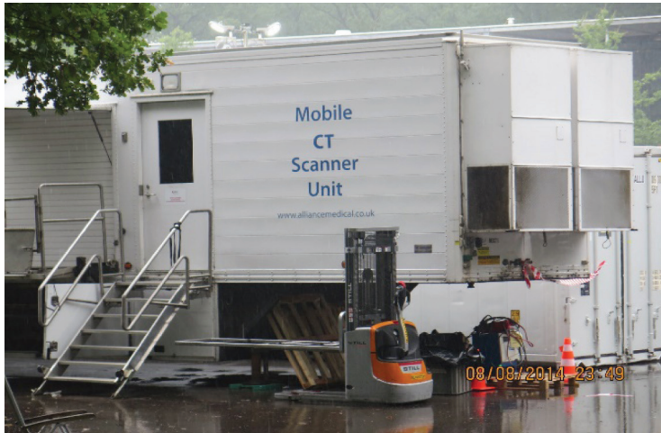
FIG. 4: Portable PMCT scanner