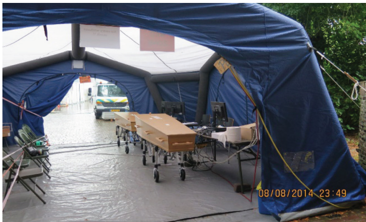
FIG. 5: At the entrance of the 'Front Office' in the temporary mortuary